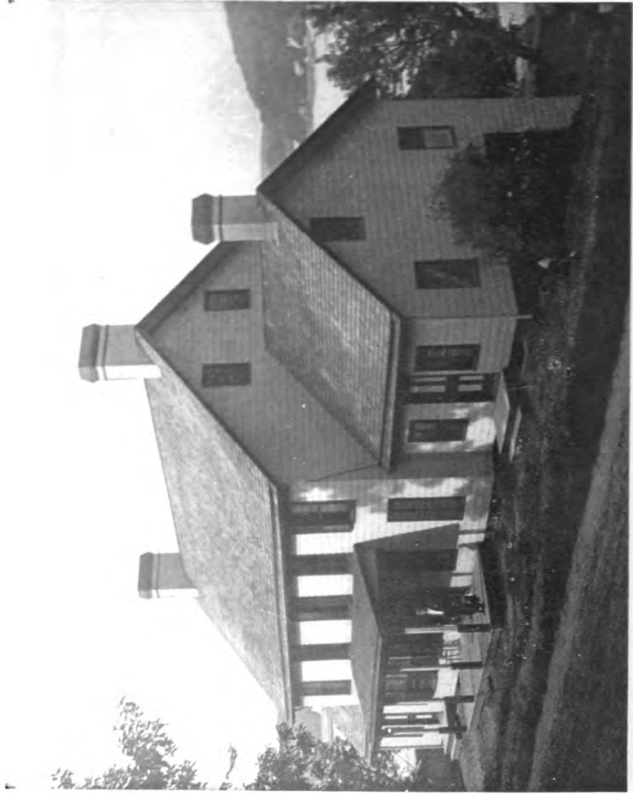
THE DINING HALL AT THE BIOLOGICAL LABORATORY