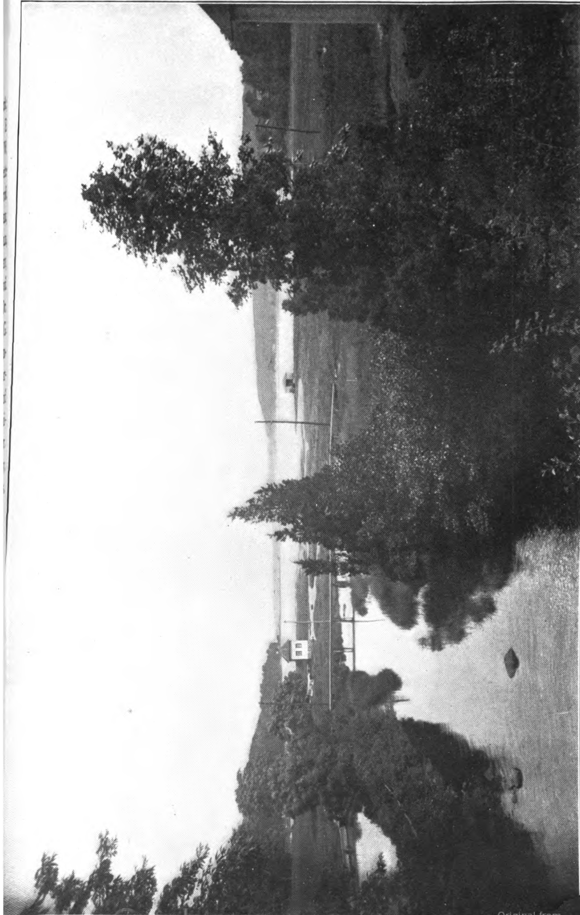
VIEW OF THE ESTUARY AND INNER HARBOR, LOOKING DOWN THE VALLEY. THE LABORATORIES STAND ON THE LEFT SIDE OF THE INNER HARBOR.