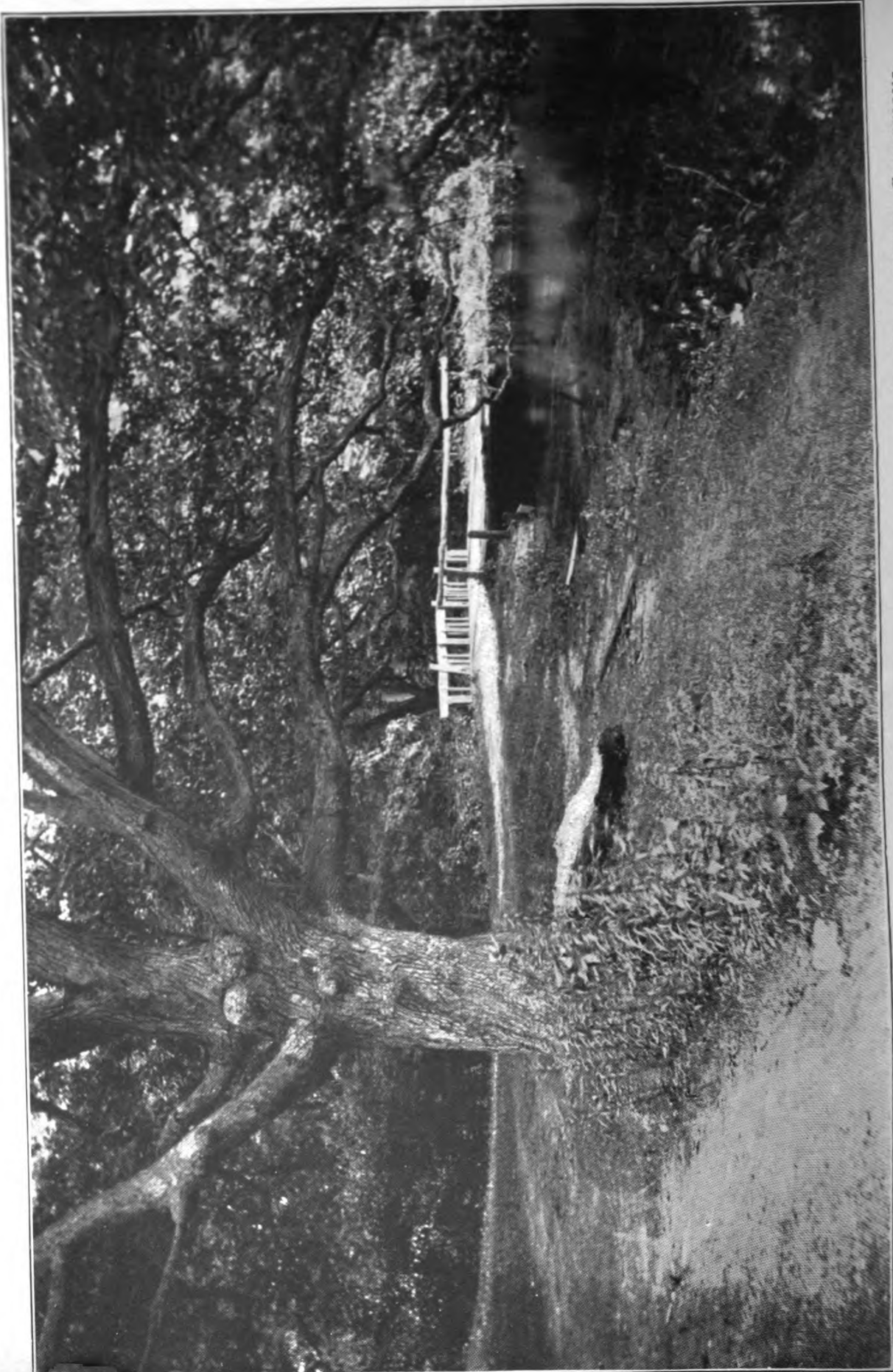
VIEW OF ROAD OVER DAM AT THE SECOND LAKE, TO ILLUSTRATE TYPICAL FOREST AND FRESH WATER CONDITIONS. GREAT OAK IN FOREGROUND.