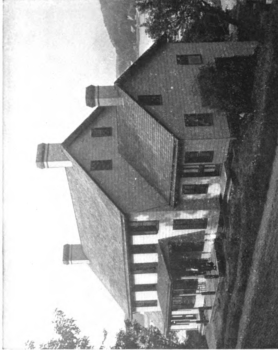
THE DINING HALL BUILDING AT THE BIOLOGICAL LABORATORY.