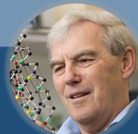
Richard Henderson Programme Leader Former LMB Director MRC-LMB