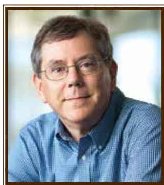
ARTHUR D. LEVINSON PIONEER IN BIOTECHNOLOGY DEVELOPMENT