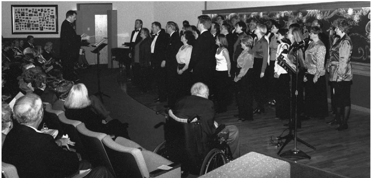
The Blue Hill Troupe musical group