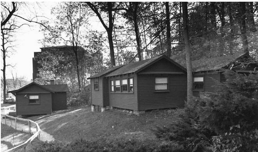
Historic Guest Cabins

In November, members of the facilities staff removed the old guest cabins north of the Beckman Neuroscience Center to make room for the construction of the new Samuel Freeman Building. The new building will house facilities for computational neuroscience, an important component in the further expansion of neuroscience program. We were saddened to see the historic (albeit utilitarian) cabins come down, but it was not possible to preserve them for relocation due to their extensive deterioration.