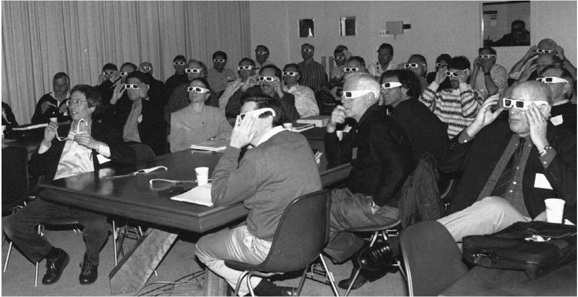
Banbury meeting participants watch cells in three dimensions.