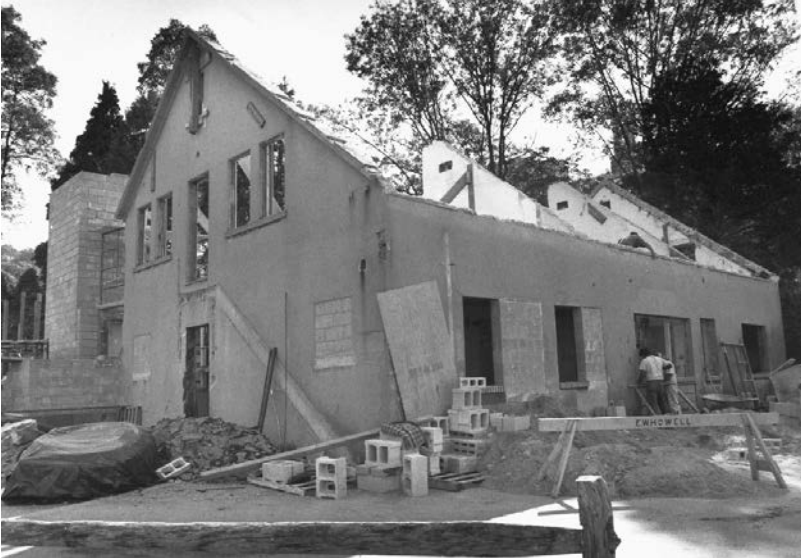
Power House renovations