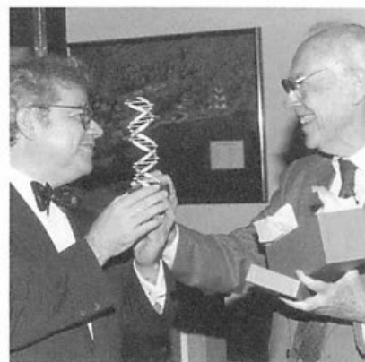
Emanuel Ax and J.D. Watson

Grace Auditorium was the setting for many other musical performances during our meeting season. On April 27, at the meeting on zebrafish,